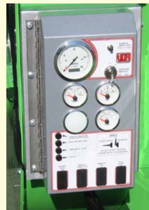
Hinged instrument panel allows easy access to the instrument wiring. All engine monitoring gauges are backlit for increased visibility.