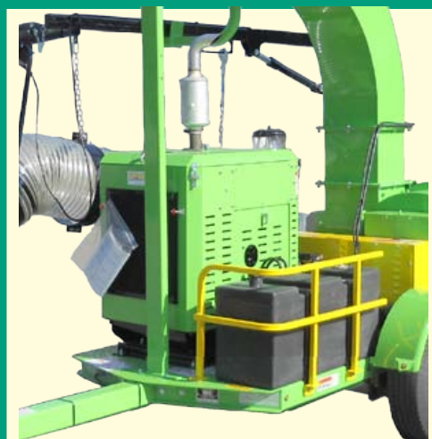
Customized, modular sheet metal with louvers is provided to protect the engine while allowing access to all the critical maintenance areas.